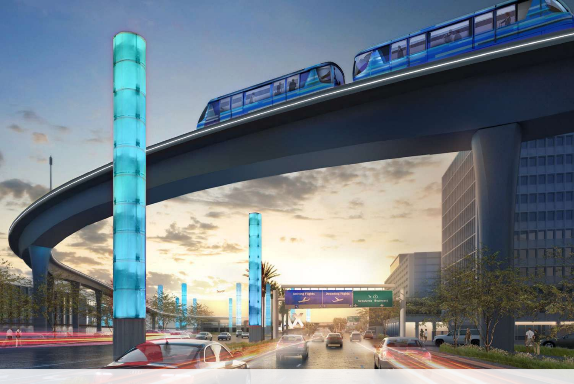
LAX Landside Access Modernization Program (LAMP)